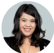
Pandu Sastrowardoyo Supervisory Board Asosiasi Blockchain Indonesia